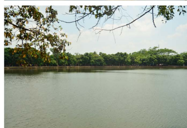
(land and water)